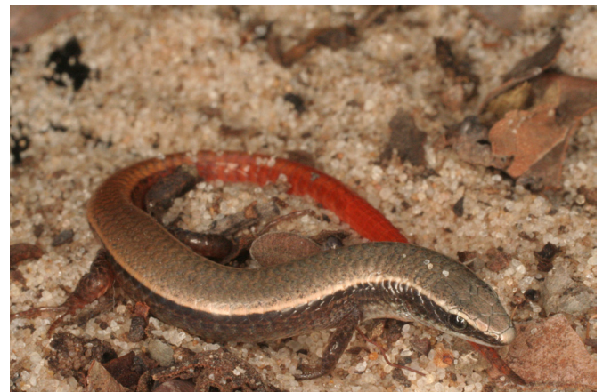
FIGURE 1. Procellosaurinus erythrocerus collected at the dune fields of São Francisco river, state of Bahia, Brazil.

This new report of P. erythrocerus supports the